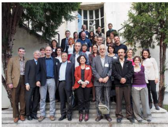
Fig. 2 The participants of the European Register of Cystic Echinococcosis (ERCE). Representatives of the centres from 16 European and Asian countries (Albania, Austria, Bulgaria, France, Georgia, Greece, Hungary, Iran, Italy, Palestine, Poland, Romania, Serbia, The Netherlands, Spain and Turkey) at the official launch meeting on ERCE. The meeting was held at the Italian National Institute of Health (Istituto Superiore di Sanita, ISS) in Rome, Italy, between 12 and 13 November 2015

ERCE is a single multicentre database located within the secured IT network of ISS, in Rome, where patient data, including demographic information, CE-related clinical