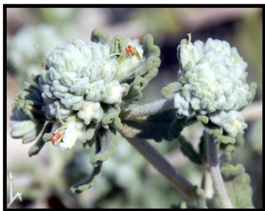
Figure 1: Leaves and flowers of ( Teucrium capitatum ). Leaves appear opposite, entire, dentate, and color of the flower is cream and white. Specimens collected and images captured from Qabatia Mountains (Jenin District- Palestine) on 13/11/2013.

Teucrium capitatum is reported to contain many important alkaloids known as cetskaderan as well as saastron, volatile oil, arbohydrate (glucose, fructose, sucrose, ramnoz, and raffinose), sterolat and turbines, flavone, gelokozydat, flavonoids, and volatile oil. More than 45 compounds are described in TC, including the compound responsible for the well-known bitter taste of this plant (pkrobin). (Al-Qahtani, 2005).